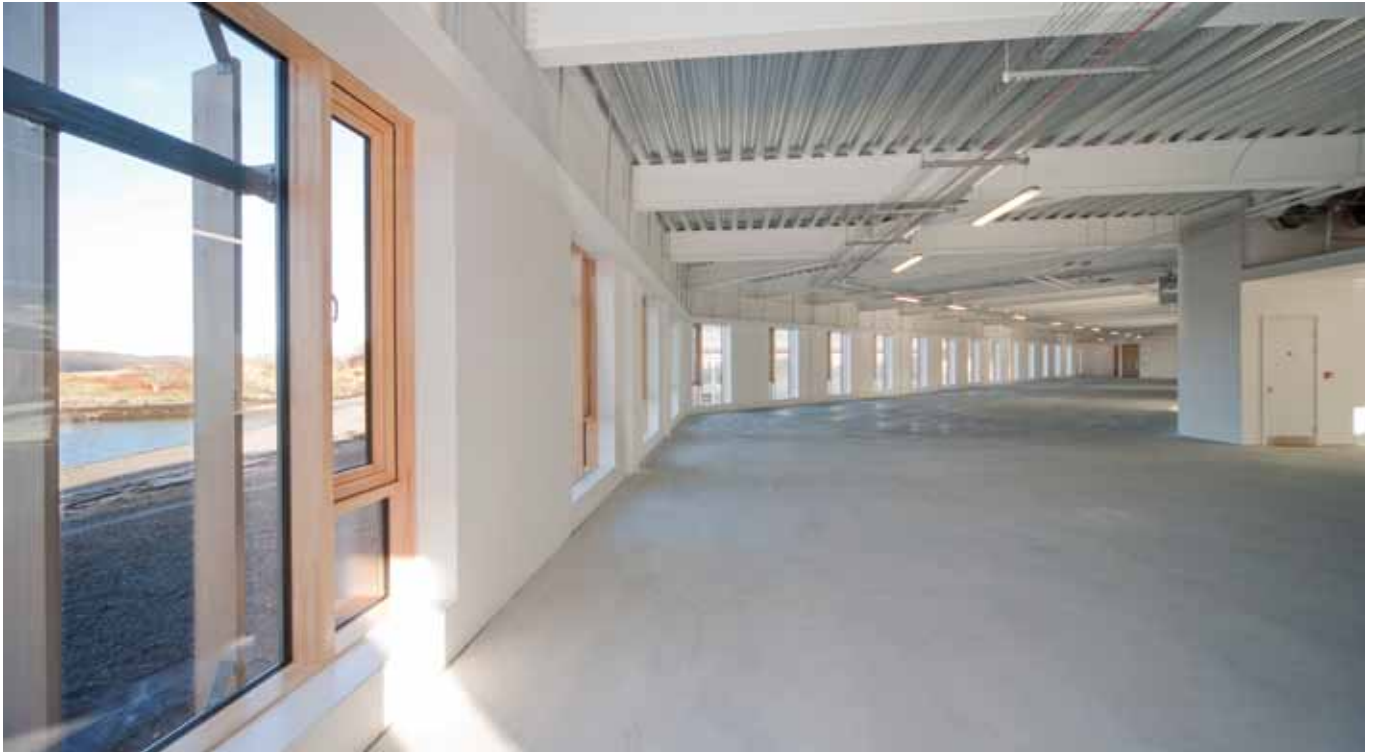
First floor accommodation prior to fit-out.