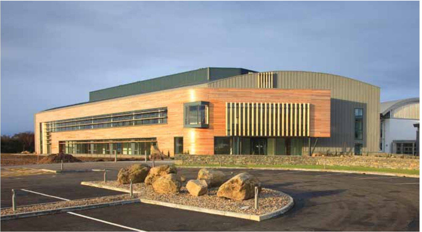
Malin House, European Marine Science Park, Argyll.