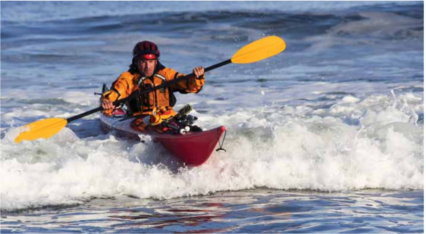
Activities include sailing, diving, kayaking, hill walking, and skiing.