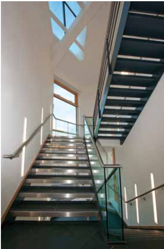
First floor stairwell.