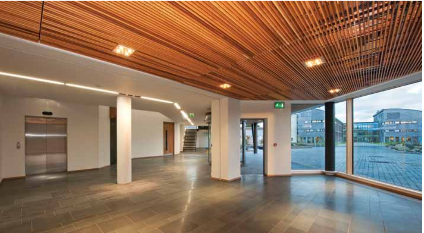
Entrance foyer looking across towards the Scottish Association for Marine Science (SAMS).