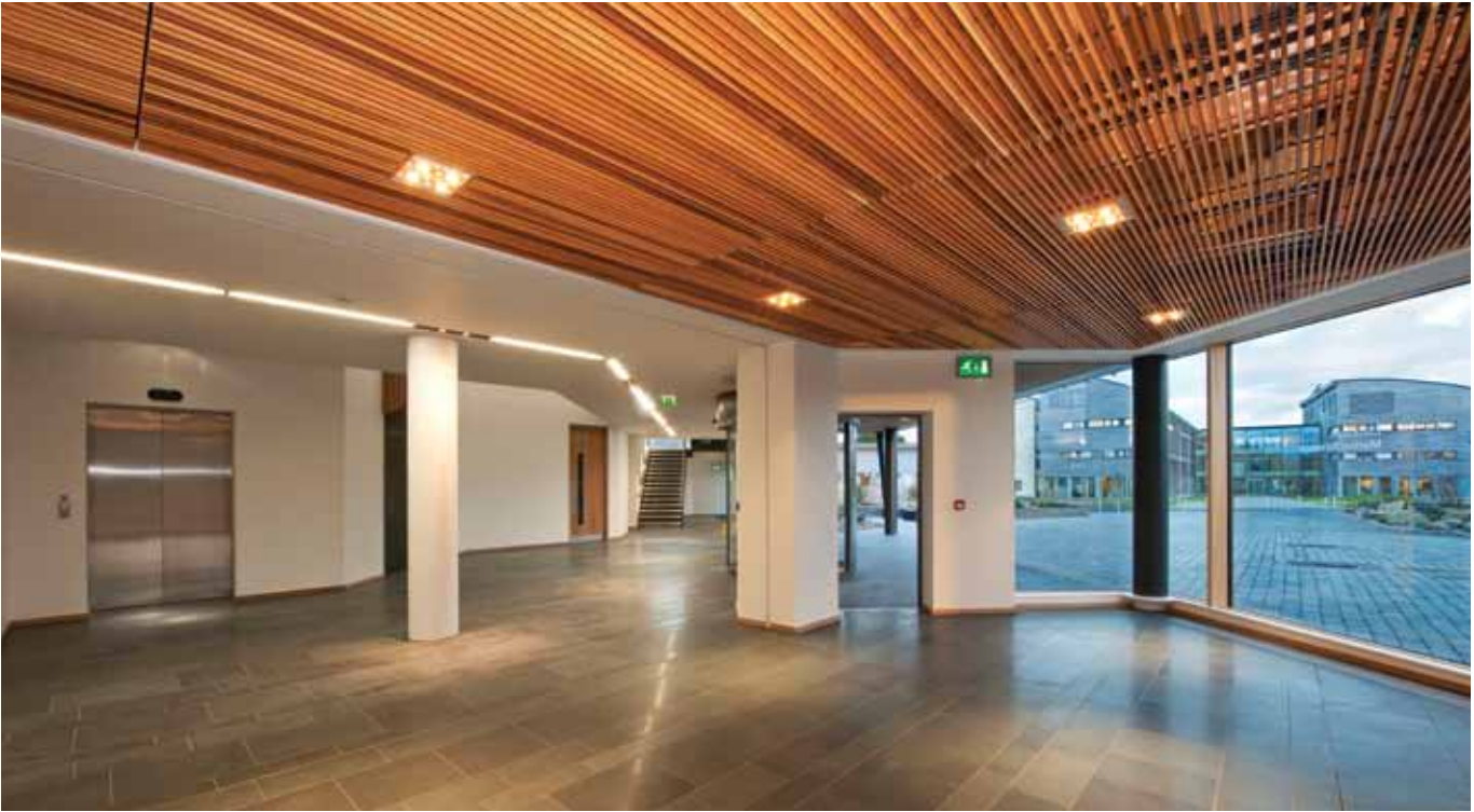
Entrance foyer looking across towards the Scottish Association for Marine Science (SAMS).